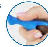
ergonomically designed handle