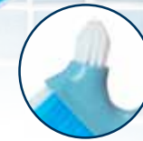
V-shape brush head