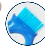
bevelled brush head